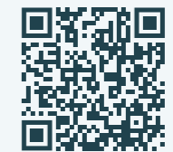
Digital tour by Breisach-Touristik