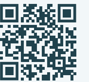
Audio tour on the Jewish history in Breisach